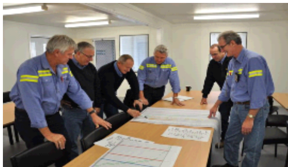
Part of Moolarben Coal Management Team

The Environmental Assessment Report for the Stage 2 Project was submitted to the NSW Minister for Planning in March 2009, as required under Part 3A of the Environmental Planning and Assessment Act 1979 . The Environmental Assessment Report was then publicly exhibited for 6 weeks from 18 March 2009 and submissions invited from those interested in the project. Around 170 submissions were made to the Department of Planning in response to the exhibited Environmental Assessment Report. Approximately half of the submissions received expressed support for the project. The other half either expressed concerns or objected to the project. A response to these submissions has been prepared and submitted to the Department of Planning. Moolarben Coal Operations expects it will gain approval for the Stage 2 Project shortly.