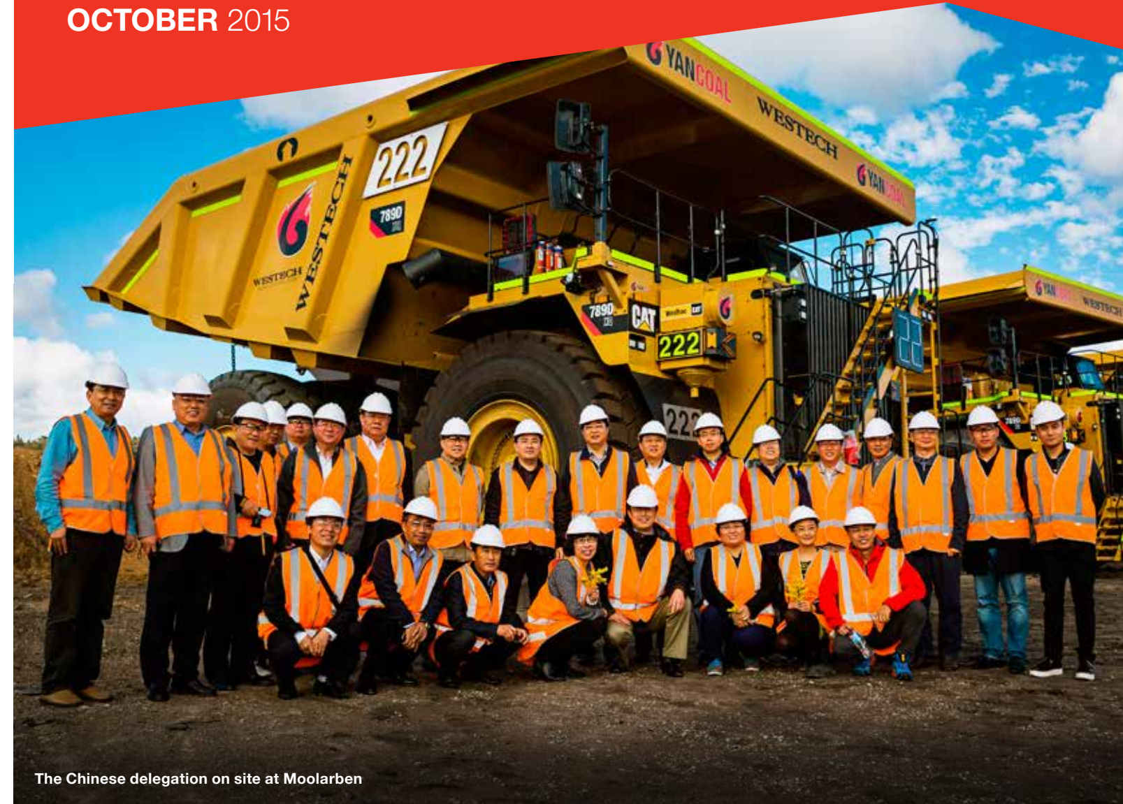
The Chinese delegation on site at Moolarben