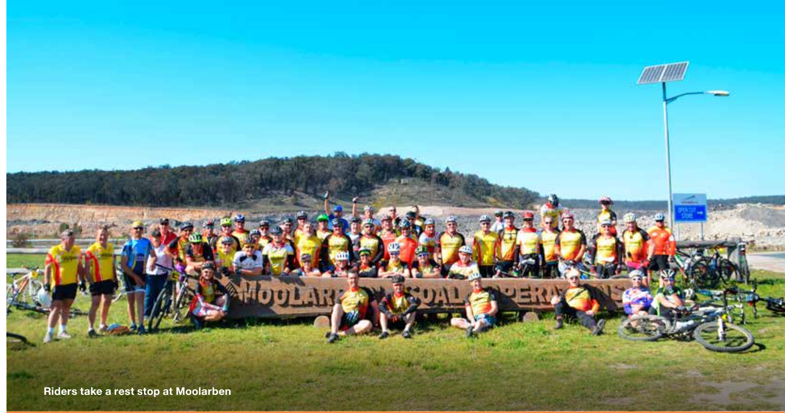
Riders take a rest stop at Moolarben

If you have a community project or activity, but don't have the funds to make it happen, the Community Support Program can assist you too.